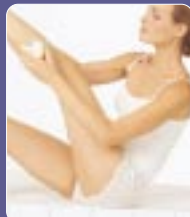
Perfect for legs