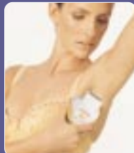
Shaver attachment is great for sensitive areas