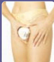
Ideal for bikini line

Caution Before plugging into an electrical outlet, make sure that the adapter is appropriate for the local voltage. This is extremely important when traveling overseas.